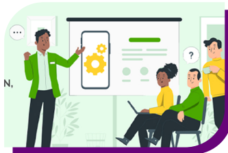
DIGITAL JOB ASSIGNMENT