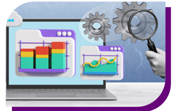
DIGITAL PERFORMANCE MONITORING