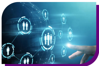
DIGITAL TALENT MANAGEMENT