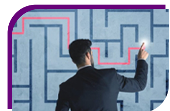
DIGITAL JOB EXIT