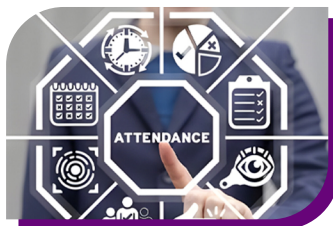
DIGITAL LEAVE & ATTENDANCE MANAGEMENT